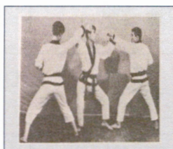
Pyung Ahn E Dan