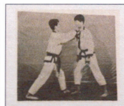
Pyung Ahn Sa Dan