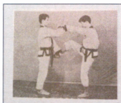
Pyung Ahn Sam Dan